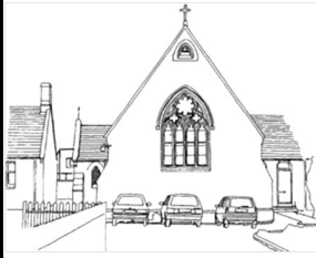
Our Lady & St John's Carlisle Road Blackwood, ML11 9RZ

Saint Mary Immaculate Larkhall & Our Lady & Saint John's Blackwood