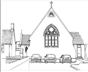
Our Lady & St John's Carlisle Road Blackwood, ML11 9RZ