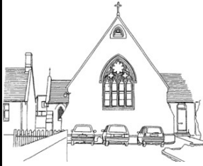
Our Lady & St John's Carlisle Road Blackwood, ML11 9RZ

Saint Mary Immaculate Larkhall & Our Lady & Saint John's Blackwood