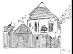
St Mary's Raploch Road Larkhall, ML9 1AN