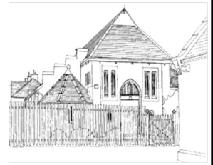
St Mary's Raploch Road Larkhall, ML9 1AN