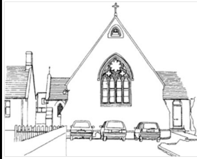
Our Lady & St John's Carlisle Road Blackwood, ML11 9RZ

SOLEMNITY OF CORPUS CHRISTI 7TH JUNE 2026