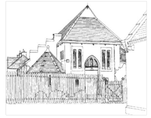
St Mary's Raploch Road Larkhall, ML9 1AN

SEVENTH SUNDAY OF EASTERTIDE 17TH MAY 2026