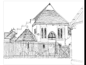
St Mary's Raploch Road Larkhall, ML9 1AN