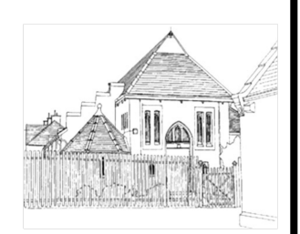
St Mary's Raploch Road Larkhall, ML9 1AN