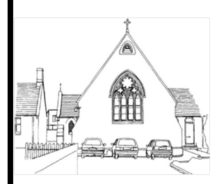
Our Lady & St John's Carlisle Road Blackwood, ML11 9RZ