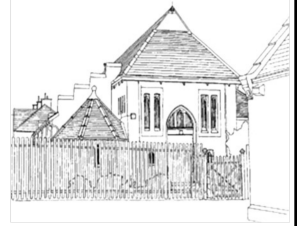
St Mary's Raploch Road Larkhall, ML9 1AN