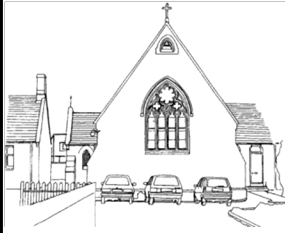
Our Lady & St John's Carlisle Road Blackwood, ML11 9RZ

Saint Mary Immaculate Larkhall & Our Lady & Saint John's Blackwood