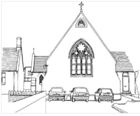
Our Lady & St John's Carlisle Road Blackwood, ML11 9RZ

Saint Mary Immaculate Larkhall & Our Lady & Saint John's Blackwood