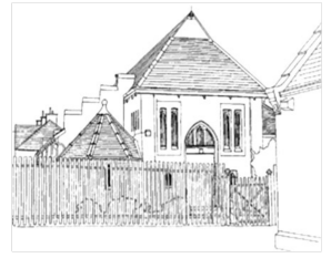
St Mary's Raploch Road Larkhall, ML9 1AN